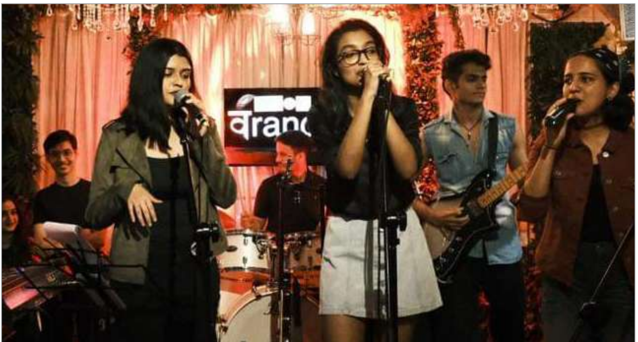
The third year western contemporary music students' lively performance at Veranda, Mumbai on April 10, 2023