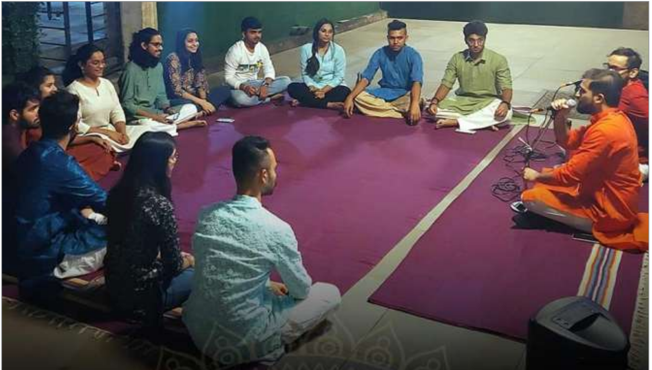
An early morning Riyaz Session was conducted in Brahm Muhurat at the Campus