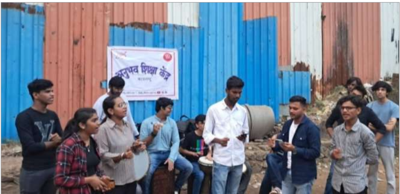
NGO Youth for Unity and Voluntary Action (YUVA) Kharhar, Navi Mumbai on November 13, 2022 Communicative English ICA in collaboration with YUVA's Anubhav Shiksha Kendra to sensitise the aspiring artists about their important role and the value of their contribution in the larger society.