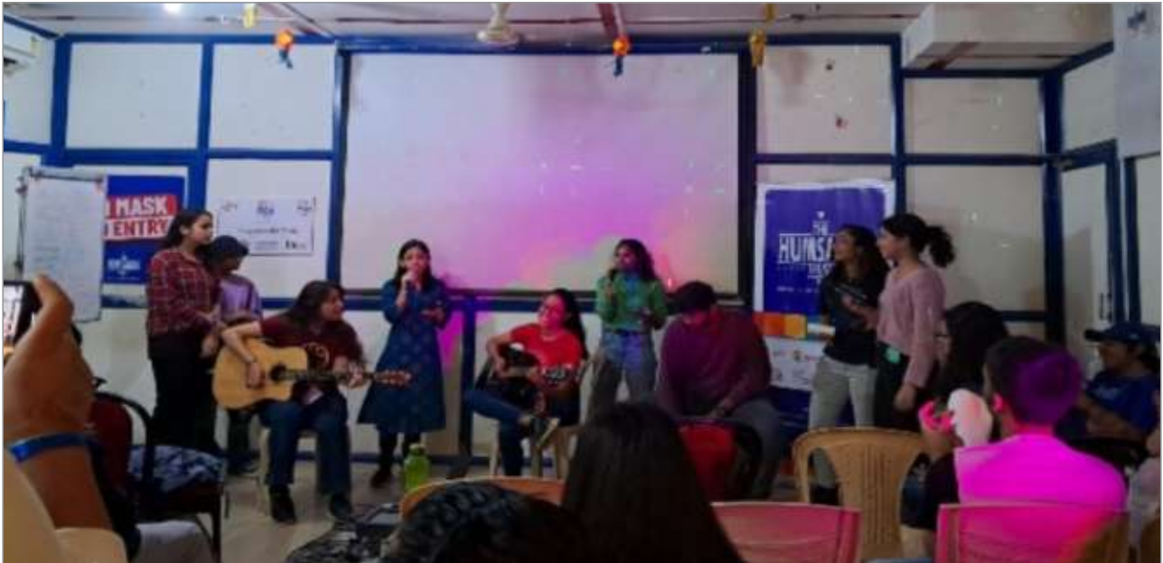
Humsafar Trust (Since 1994) Santacruz East, Mumbai on November 5, 2022 Communicative English ICA in collaboration with Humsafar Trust to sensitise the aspiring artists about their important role and the value of their contribution in the larger society.