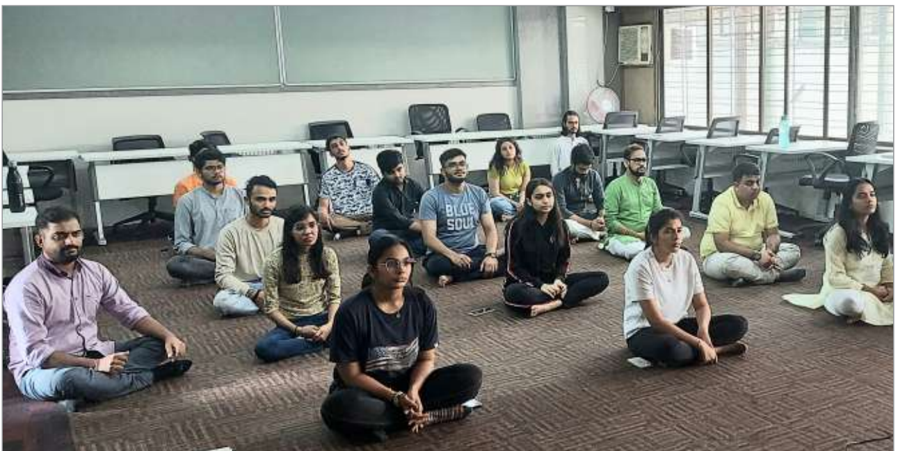
Yoga & Meditation session on April 27, 2023.

Communicative English ICA Collaborative Project with Pukar to sensitise the aspiring artists about their important role and the value of their contribution in the larger society.