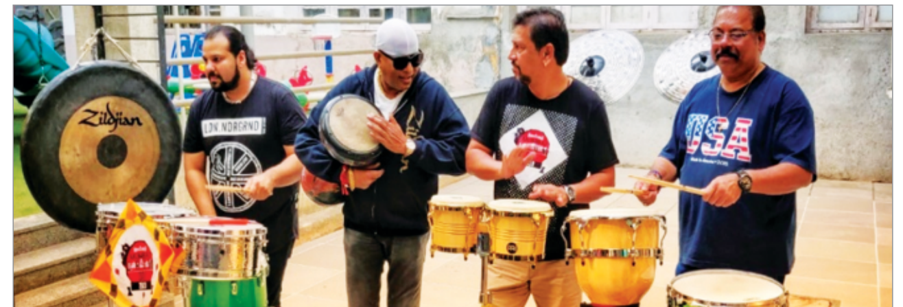
Drum Day Rehearsal at SoPA campus