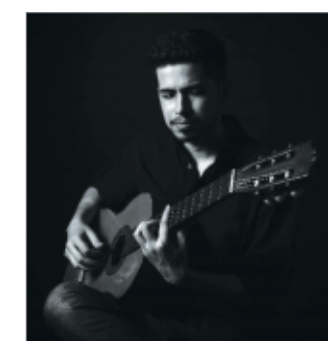
Achal Yadav Production