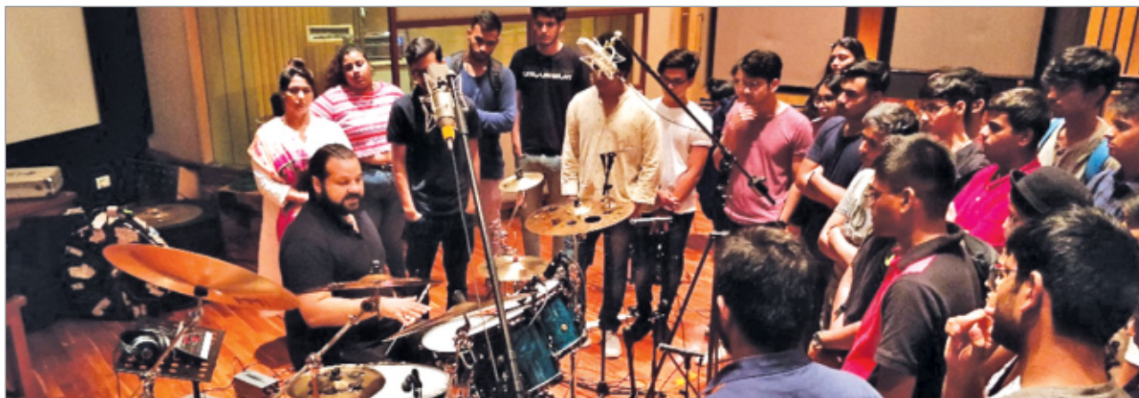
Industrial visit to Yashraj Studios in June 2019