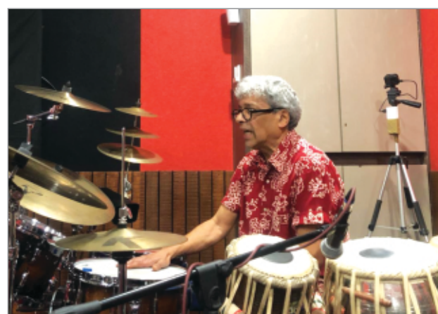
Shri Trilo Gurtu Ji graced the school by conducting a drum workshop on January 2019