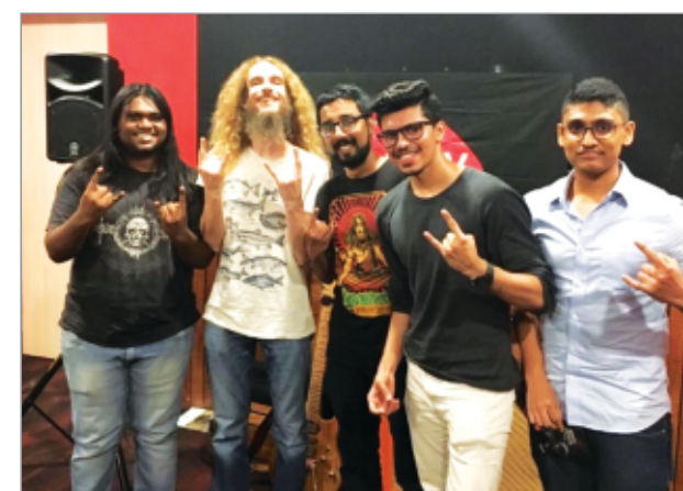
Mr. Guthrie Govan, the famous Guitarist was invited to the school for workshop on October 2018