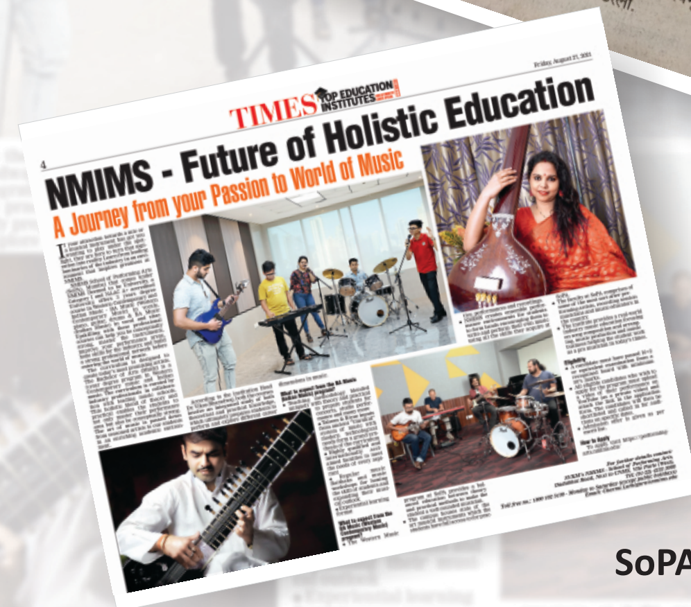
SoPA in the News