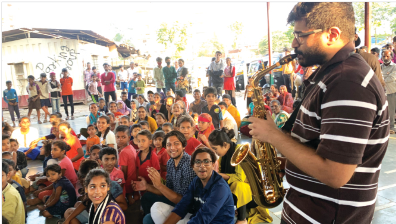
SoPA students spread love & happiness through music among children at Children Resource Centre (NGO), October 2021