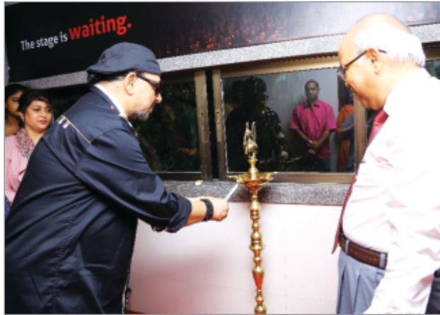
Inauguration Day - 13.08.2018